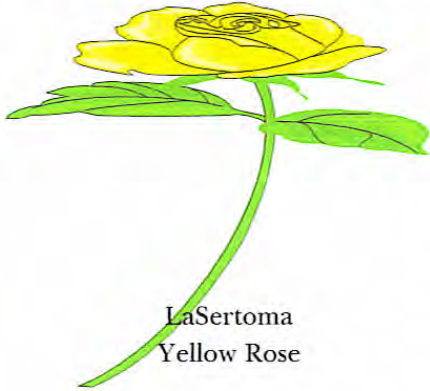
LaSertoma Yellow Rose